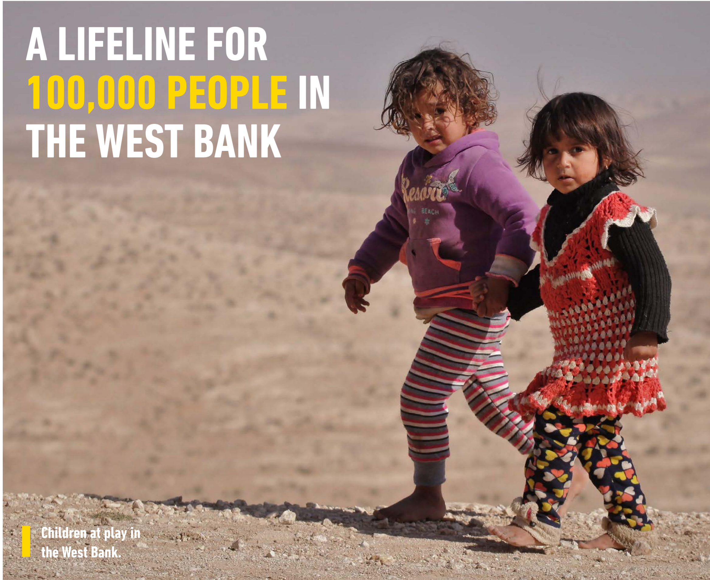
Children at play in the West Bank.

Islamic Relief began working in the West Bank in 2002, serving on average 100,000 people a year in a region where 2.5 million rely on external aid.