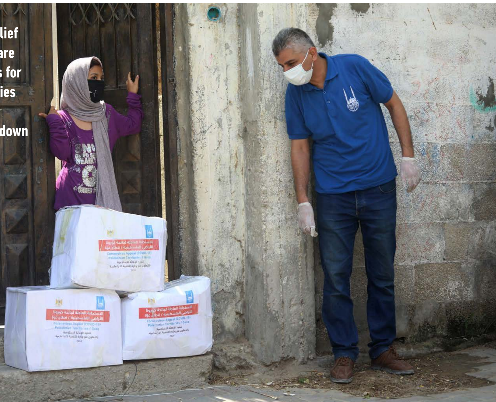
Islamic Relief staff prepare food packs for poor families during the Covid lockdown in Gaza.

With its dense population and collapsing economy, Gaza is in danger of being overwhelmed by Covid-19. Its health sector is at breaking point, with a severe shortage of specialist staff and medical supplies. Electricity and water are also in short supply.